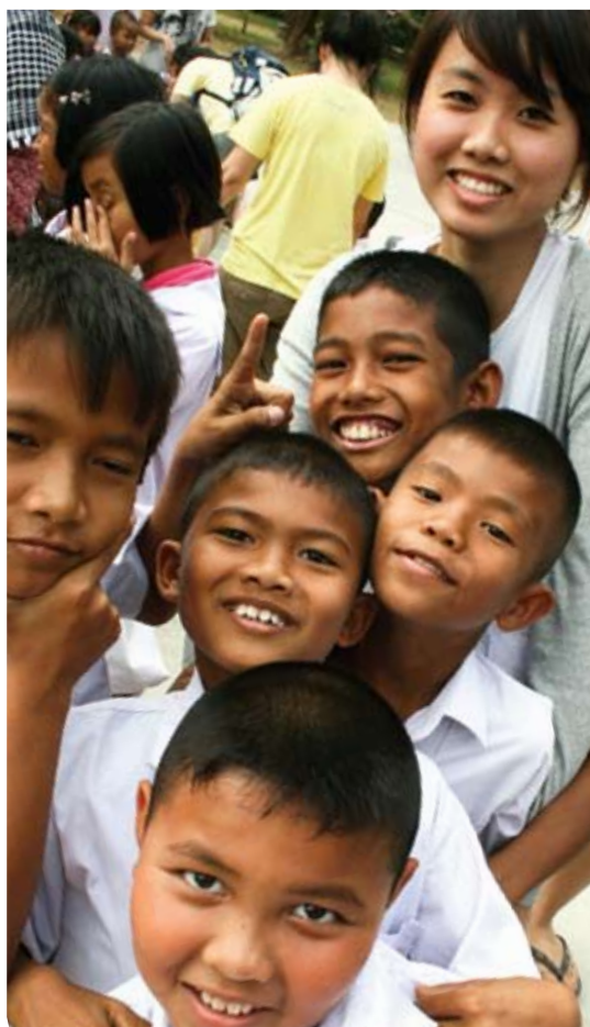
VOLUNTEERS AND CHILDREN IN SUPANBURI

The club's next adventure will take them to Khao Yai National Park, where members will once again challenge their stamina and increase their physical fitness.