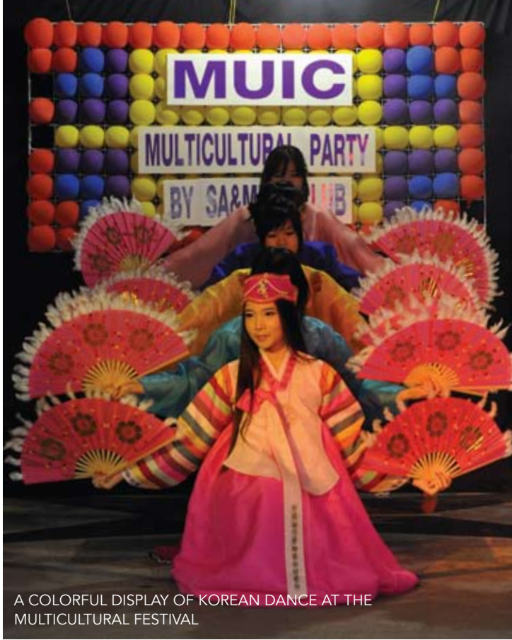
A COLORFUL DISPLAY OF KOREAN DANCE AT THE MULTICULTURAL FESTIVAL