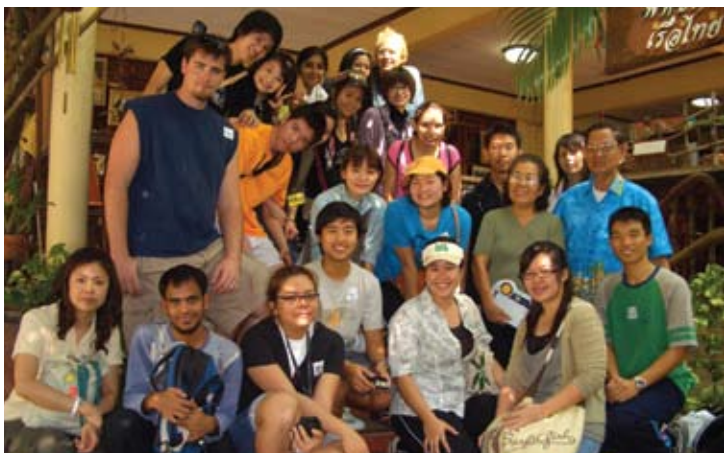
MEMBERS OF THE CYCLING CLUB IN AYUTTHAYA