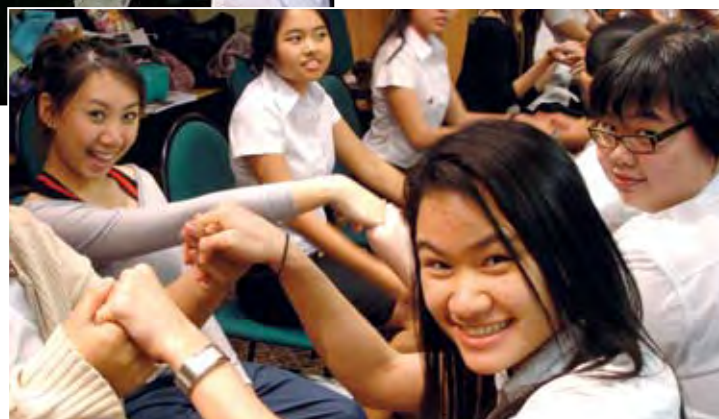
LEADERSHIP WORKSHOP FOR A STRONGER STUDENT ASSOCIATION

Forty teams from 12 universities participated in the competition, six of which were from MUIC. Not unexpectedly, all six of our college teams