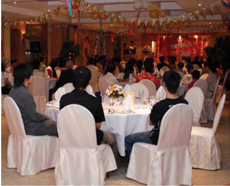
INTERSHIP BANQUET AT THE SALAYA PAVILION HOTEL AND TRAINING CENTER