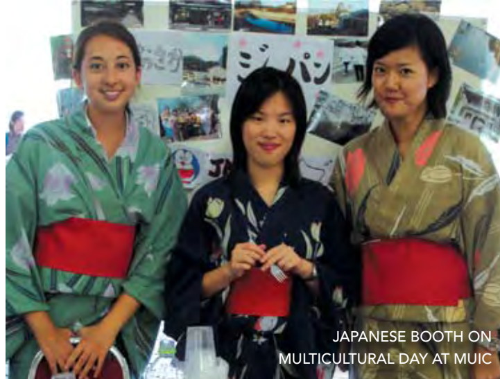
JAPANESE BOOTH ON MULTICULTURAL DAY AT MUIC

The focus wasn't entirely educational, however. Participants enjoyed