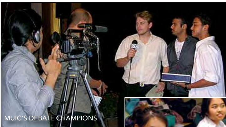
MUIC'S DEBATE CHAMPIONS