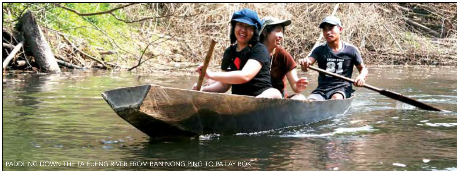
PADDLING DOWN THE TA EUENG RIVER FROM BAN NONG PING TO PA LAY BOK