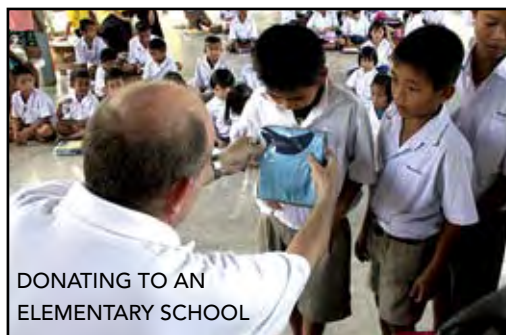
DONATING TO AN ELEMENTARY SCHOOL

The PC Program had a large number of textbooks and other teaching materials in storage, resources