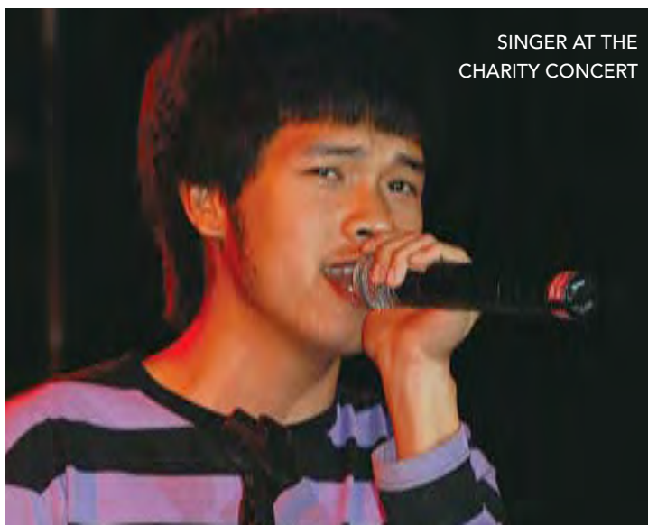
SINGER AT THE CHARITY CONCERT

The weekend was structured in order to promote a greater understanding of the martial arts. Facilitated