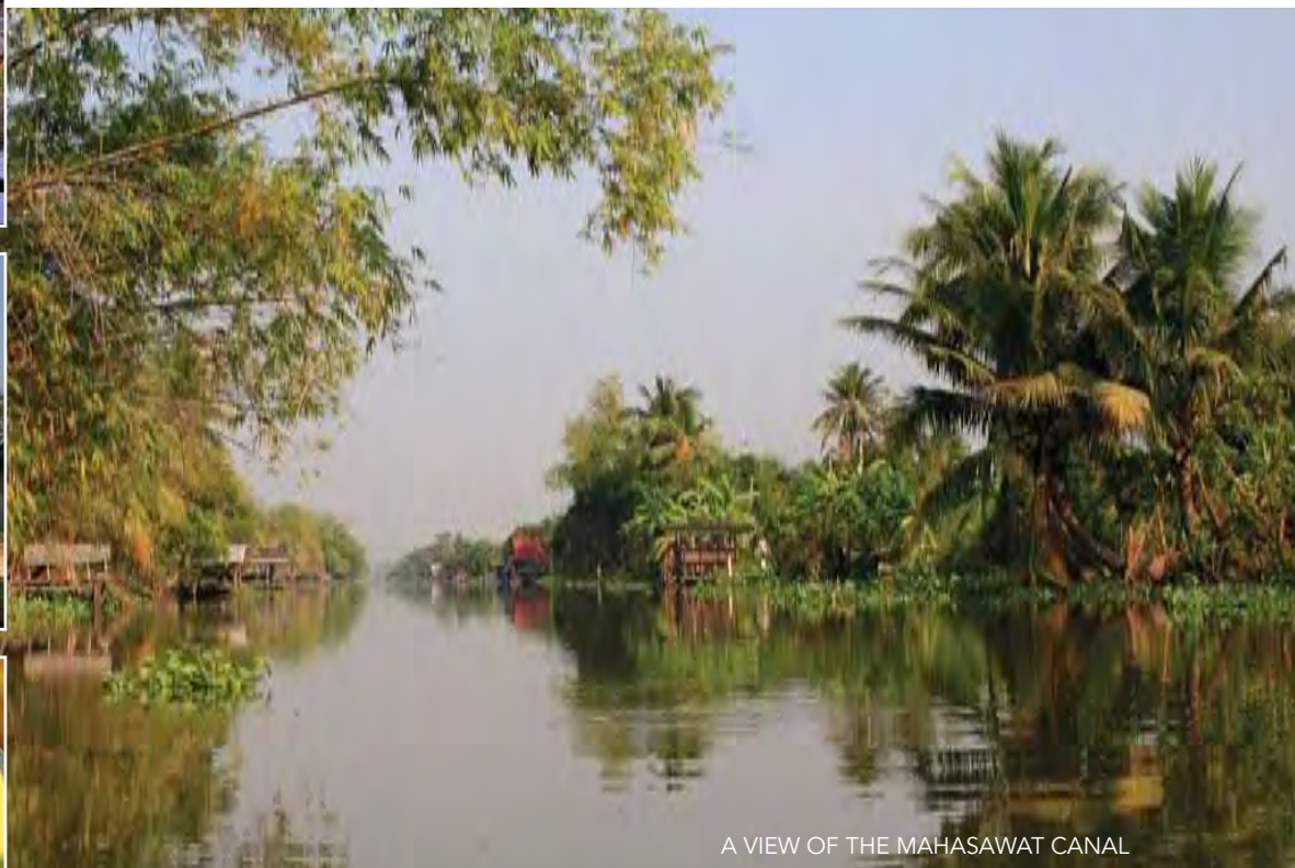
A VIEW OF THE MAHASAWAT CANAL