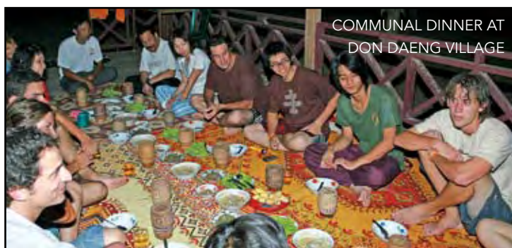
COMMUNAL DINNER AT DON DAENG VILLAGE

TWO CLASSES IN THE TRAVEL INDUSTRY MANAGEMENT DIVISION CONDUCTED EXPERIMENTAL PROJECTS, ONE IN NEIGHBORING LAOS AND THE OTHER IN THE IMMEDIATE VICINITY OF BUDDHAMONTHON DISTRICT. BOTH ACTIVITIES ENABLED STUDENTS NOT ONLY TO TRANSLATE THEORY INTO PRACTICE BUT ALSO TO ENGAGE IN COMMUNITY SERVICE.