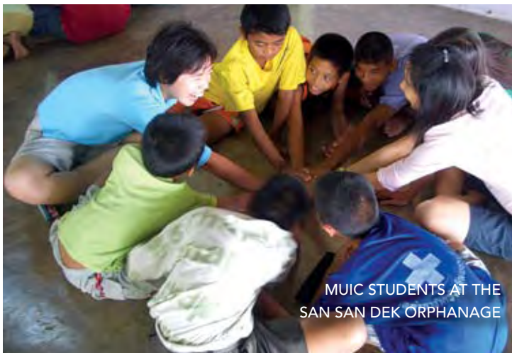
MUIC STUDENTS AT THE SAN SAN DEK ORPHANAGE