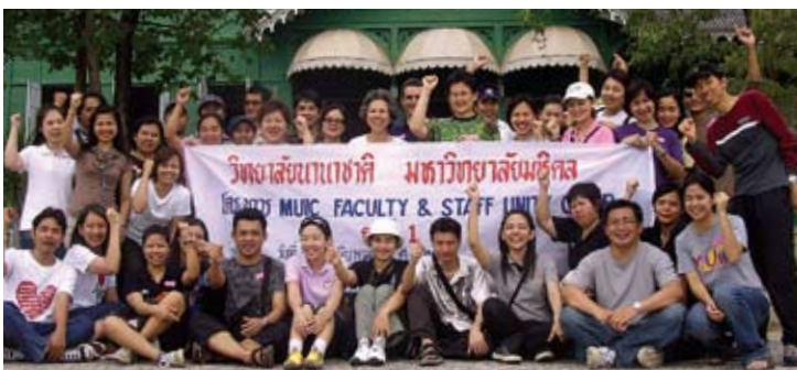
PARTICIPANTS AT THE MUIC UNITY CAMP