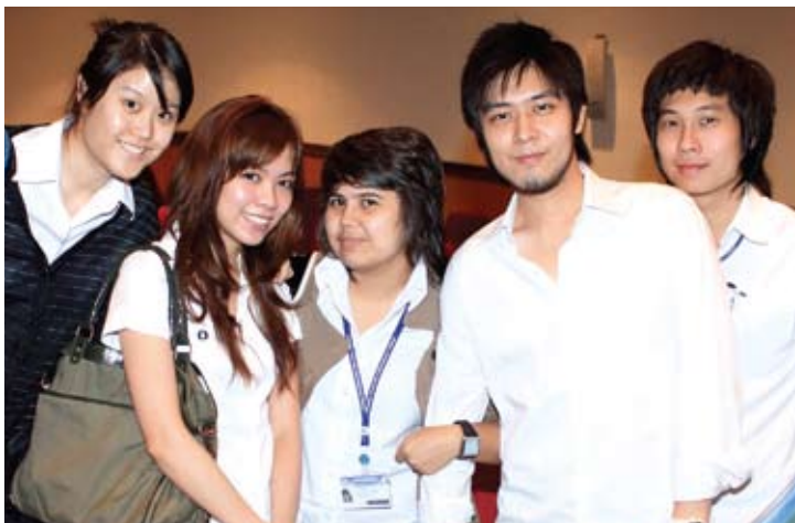
PARTICIPANTS AT THE JOB APPLICATION CONFERENCE