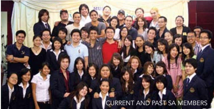
CURRENT AND PAST SA MEMBERS