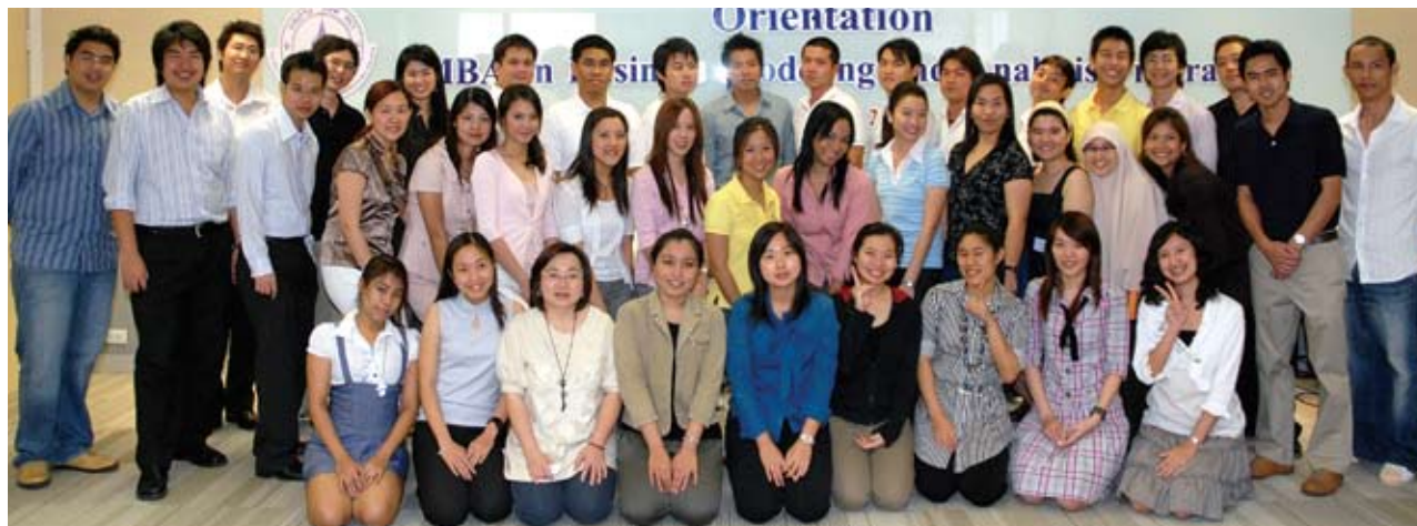
THE FIRST MBA CLASS AT ORIENTATION

The participants then took a brief tour of the Sathorn facilities and proceeded to the Salaya campus, where they enjoyed a luncheon at the Salaya