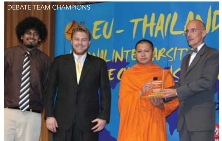
DEBATE TEAM CHAMPIONS