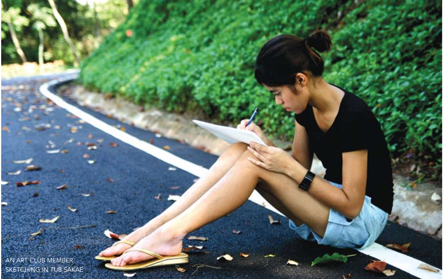
AN ART CLUB MEMBER SKETCHING IN TUB SAKAE