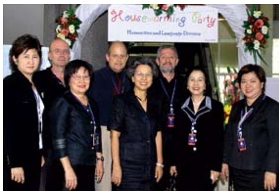
HOUSEWARMING PARTY AT THE SALAYA CENTER

This system of identifying buildings will be implemented in all internal and external communications, including future issues of kaleidoscope .