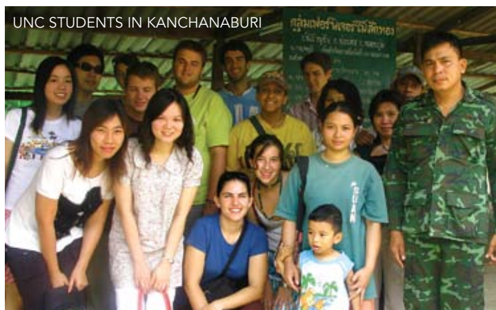
UNC STUDENTS IN KANCHANABURI

They also had an opportunity to take in some of the major tourist attractions in the Bangkok area and visit Ayutthaya.