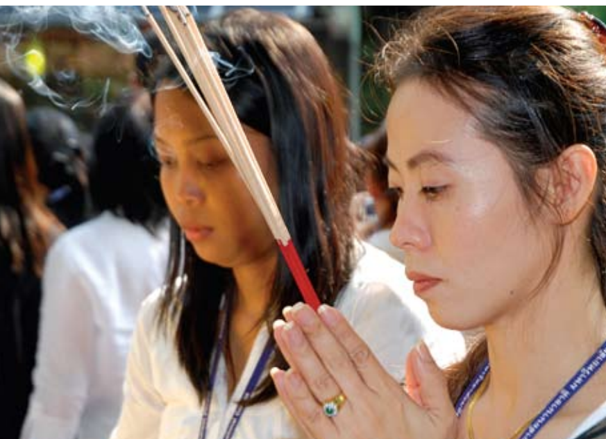
TRADITIONAL RITUALS AT THE SHRINE'S OPENING CEREMONY

In the meantime, renovations for office space on the second floor were well underway. When the finishing touches were brought to a close in late January, the entire faculty and staff of