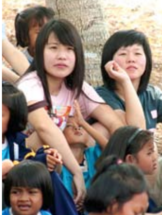
VOLUNTEERS IN KANCHANABURI

Eighteen universities from all parts of Thailand participated in the competition. The MUIC adroitly battled their way through the preliminary rounds. Victory was finally assured when both Team 1, with