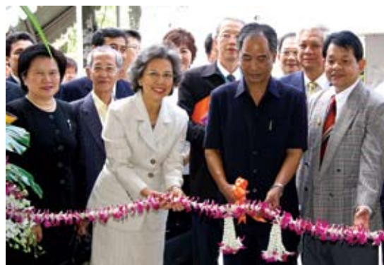
THE ASC GRAND OPENING