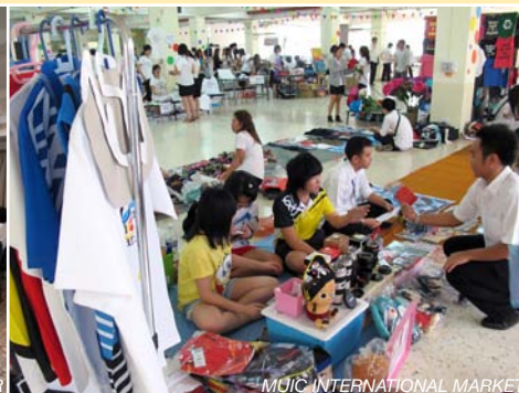
MUIC INTERNATIONAL MARKET