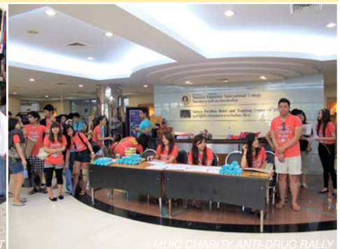
MUIC CHARITY ANTI-DRUG RALLY