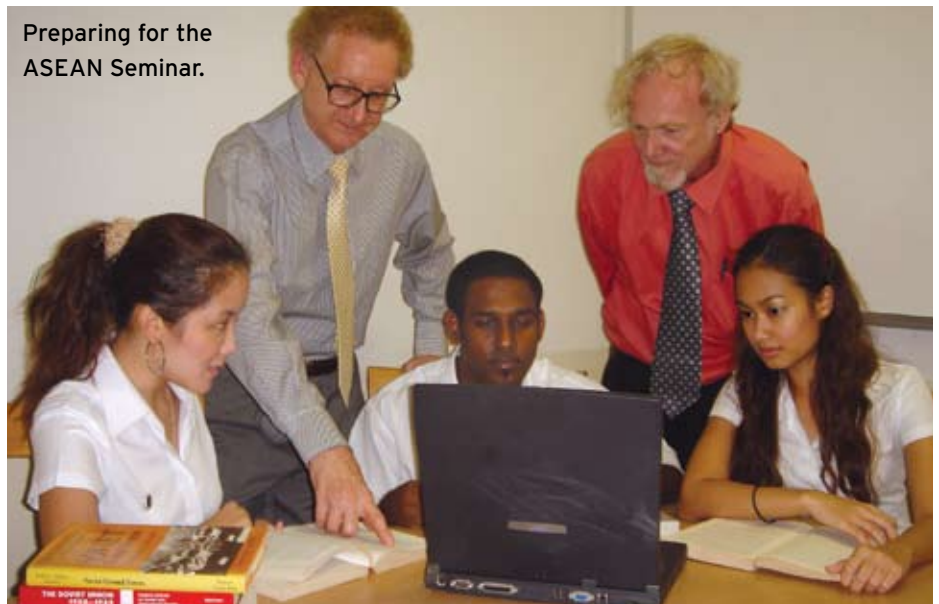
Preparing for the ASEAN Seminar.