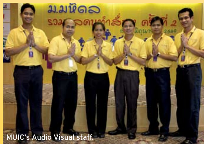
MUIC's Audio Visual staff.