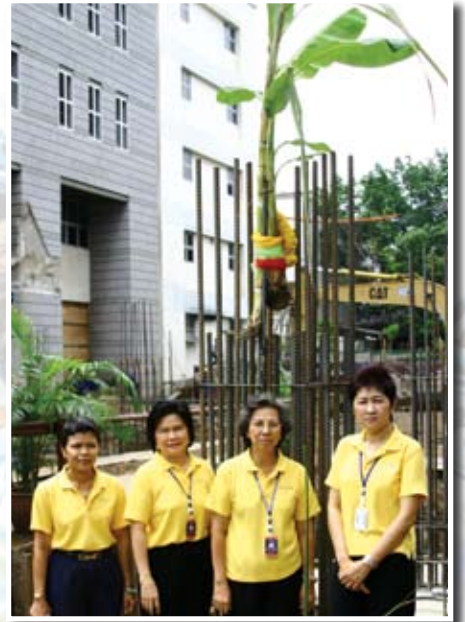
Executive staff members in front of the central pillar.

In addition, the college has recently renovated the second-floor administrative office, enhancing its visibility and offering easier access.