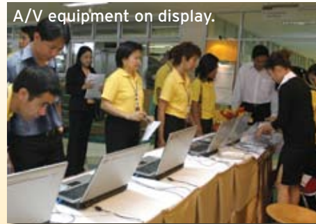
A/V equipment on display.

The first day's morning session was devoted to the issue of inter-