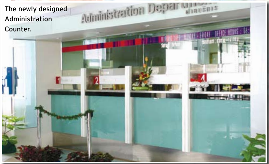
The newly designed Administration Department Counter.

Although the Open House traditionally targets students, teachers and parents, the general public is encouraged to attend.