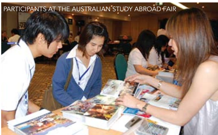
PARTICIPANTS AT THE AUSTRALIAN STUDY ABROAD FAIR

Over 9,000 international educators participated in the conference and exhibition, promoting their respective institutes. After the conference, the MUIC participants took the opportunity to visit the College of New Jersey and Princeton University.