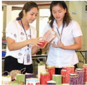
THE BANGLEN BANANA EXHIBITION