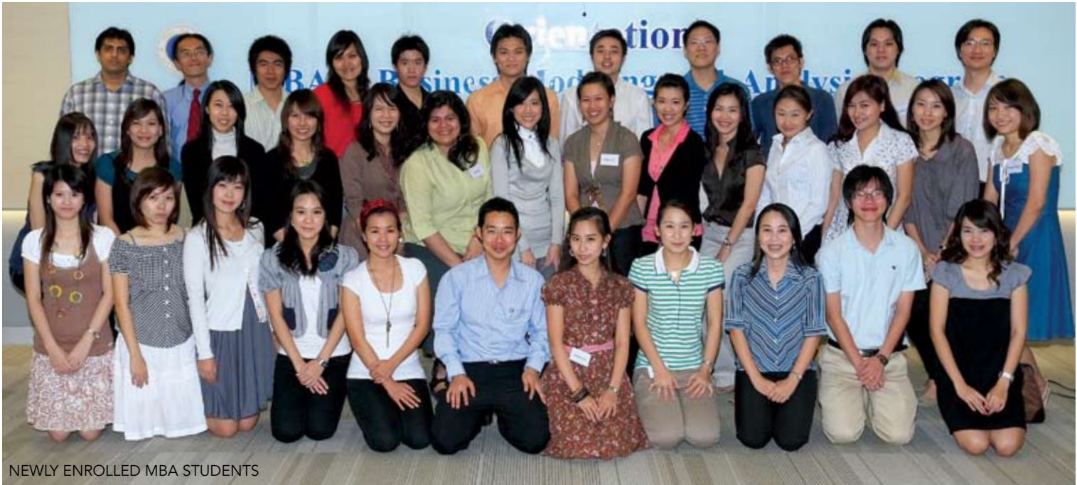
NEWLY ENROLLED MBA STUDENTS