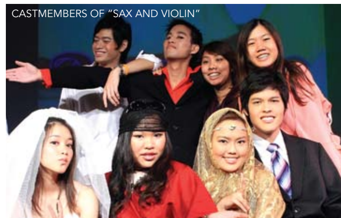
CASTMEMBERS OF "SAX AND VIOLIN"

The MUIC Music Club sponsored its annual Band competition on June 19 in the college auditorium. Approximately 70 student musicians, including MUIC alumni, represented the 16 bands which participated in the event. The winning band was The Story, which received a 3,000 Baht first prize.