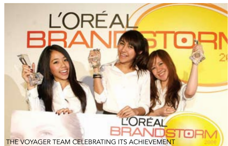
THE VOYAGER TEAM CELEBRATING ITS ACHIEVEMENT