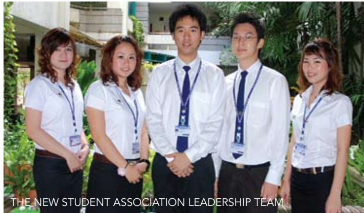
THE NEW STUDENT ASSOCIATION LEADERSHIP TEAM

In an effort to promote its community outreach activities, members of the Student Association visited the Baan Klong Sawang Arom School on June 24. They donated