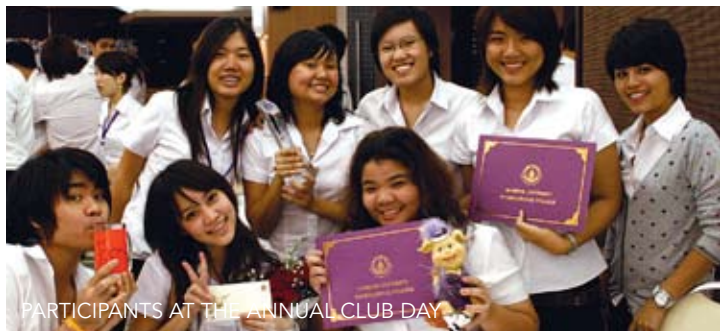
PARTICIPANTS AT THE ANNUAL CLUB DAY

school supplies and spent the day engaging the children in educational games, sports activities and English-learning sessions.