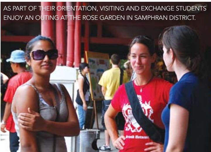
AS PART OF THEIR ORIENTATION, VISITING AND EXCHANGE STUDENTS ENJOY AN OUTING AT THE ROSE GARDEN IN SAMPHRAN DISTRICT.