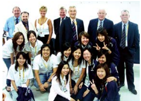
MUIC VOLUNTEERS WITH OFFICIALS AT THE UNIVERSIADE

Another group worked with students from Burapha University on CCTV/IPTV, the television network that broadcast the results of the games, showcased medal presentation and aired variety programs and news reports concerning the event. They were responsible for a range of activities, including collecting information, updating the latest news, translating documents and acting as presenters and emcees.