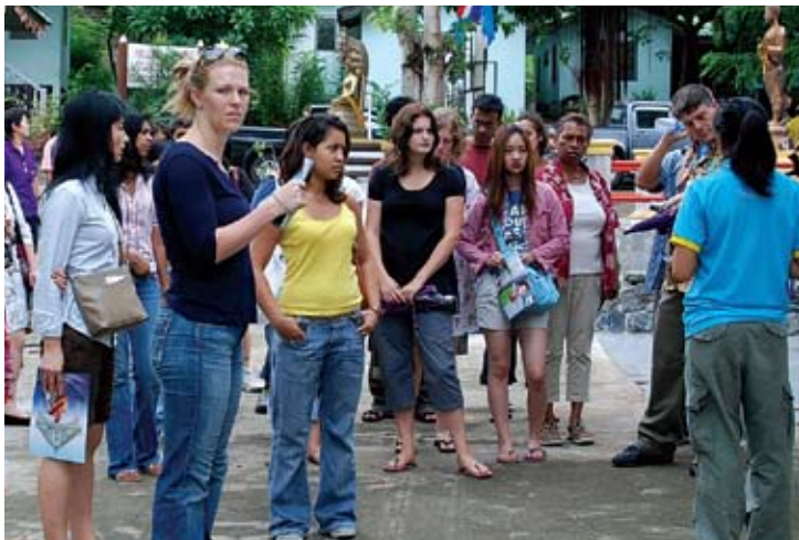
ARRIVING AT THE HIV/AIDS CENTER OF HOPE

Over the past several months regular visitors from North America arrived at MUIC, each with its own agenda: two separate groups from the University of North Carolina-Chapel Hill, Shorter College in Georgia, Steven Austin University, Texas, and the Technological Institute of Superior Studies of Monterrey, Mexico.