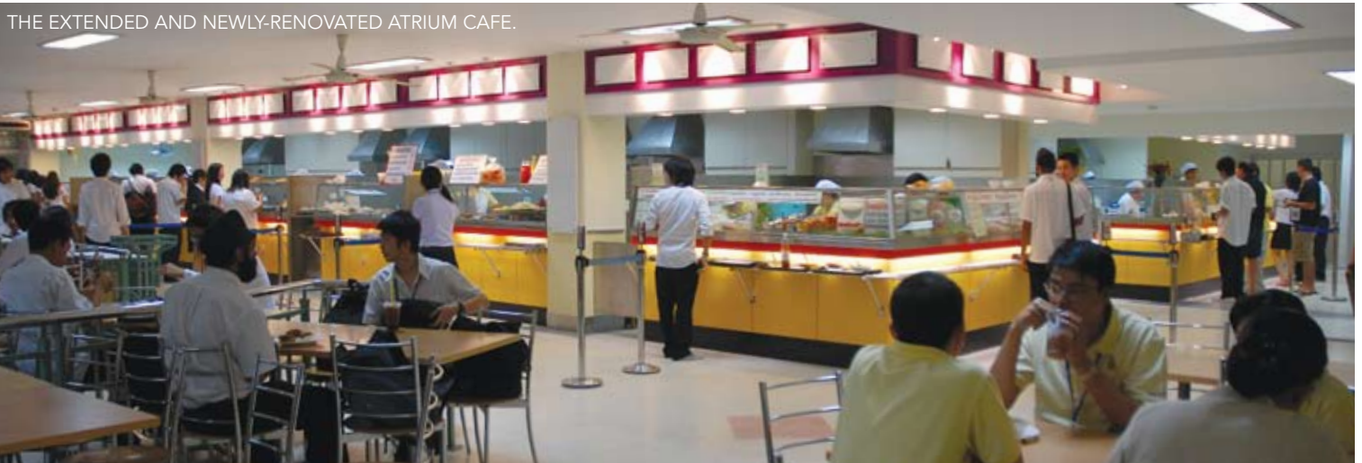
THE EXTENDED AND NEWLY-RENOVATED ATRIUM CAFE.

In the meantime, plans are underway to renovate the second floor, which will provide additional space and resources, including offices for the program's faculty and staff.