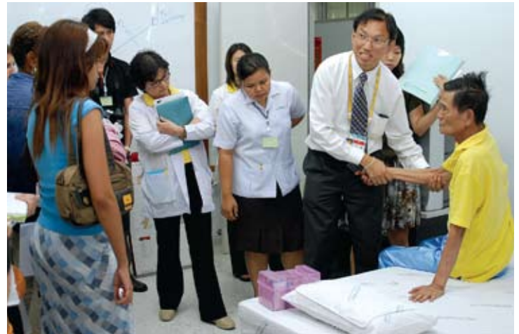
A CLINICAL DEMONSTRATION AT JUBILEE HOSPITAL

While some of the sessions were conducted at