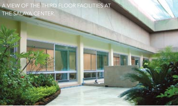
A VIEW OF THE THIRD FLOOR FACILITIES AT THE SALAYA CENTER.