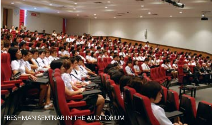
FRESHMAN SEMINAR IN THE AUDITORIUM