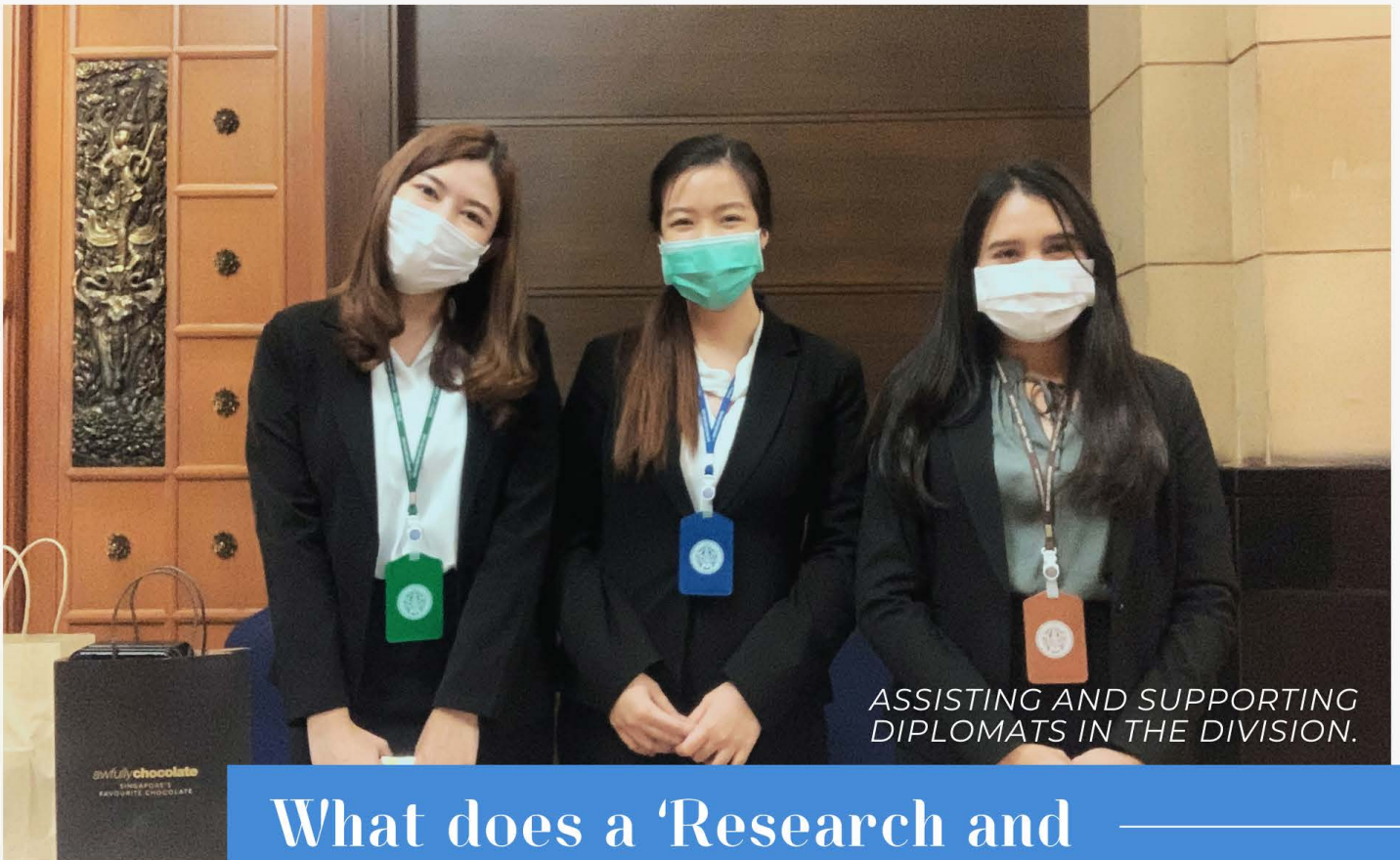
ASSISTING AND SUPPORTING DIPLOMATS IN THE DIVISION.